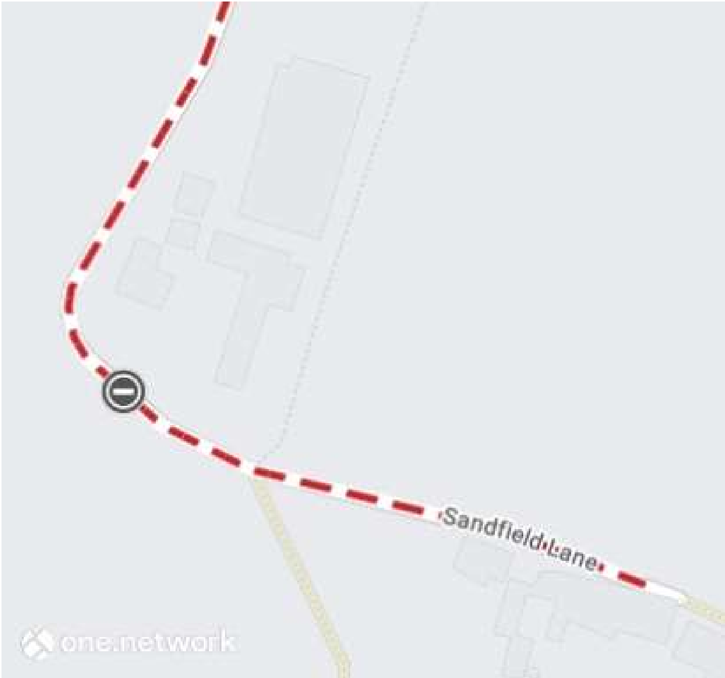
Map data © MapTiler © OpenStreetMap contributors